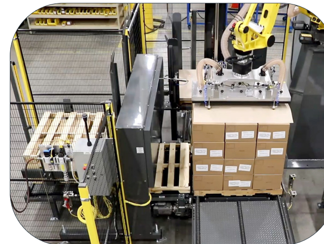
Robot placing layer pad on a pallet