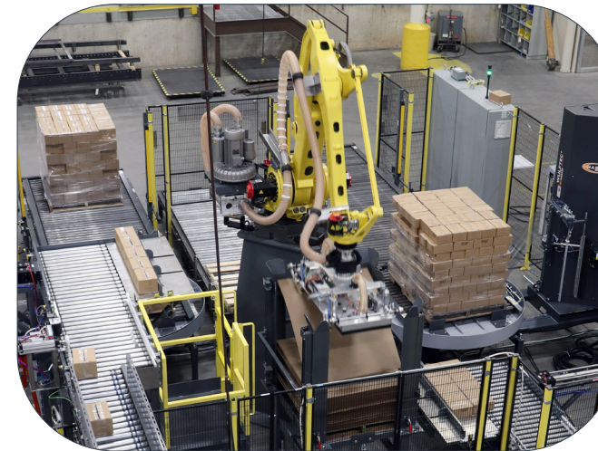
Robot picking up a layer pad