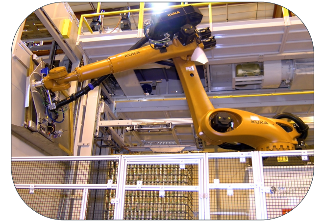
Robotic frame handler (optional)