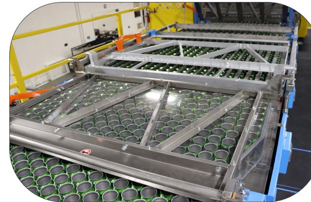
Airliner void-free pattern forming