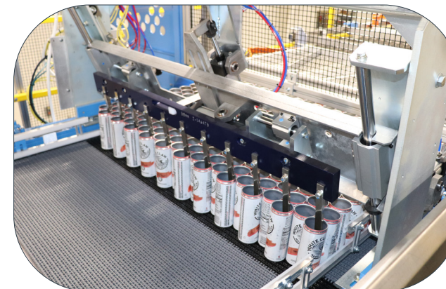
Staggerhead assembly forming can pattern