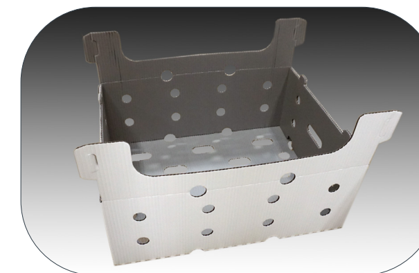
Formed Bliss box