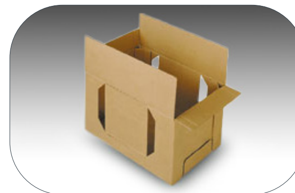
Formed Bliss box