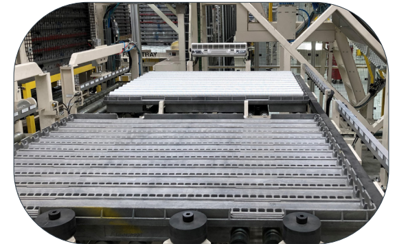
Easy Product Visibility & Accessibility