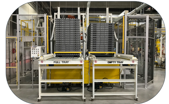
Tray Handling System for Plastic Trays

Fleetwood's robust low-cost plastic trays allow plants to maintain product inventory with less capital investment year after year. Product type or color changeover is reliably handled by the system to isolate primary from secondary product and maintain production. With optional automatic product change marker detection operators can focus on changeover in other areas of the line. The RTS system is built for the demands of 24/7 operation and driven by Fleetwood's user-friendly control system. All Fleetwood equipment is designed around the same customer focused, reliable, and innovative approach that has made us a leader in the can end market since 1956.