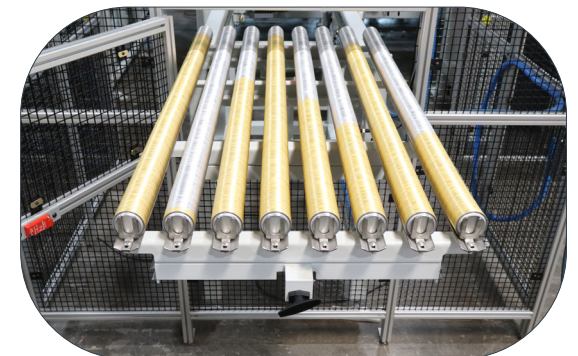
Color Change QC Sample Drawer